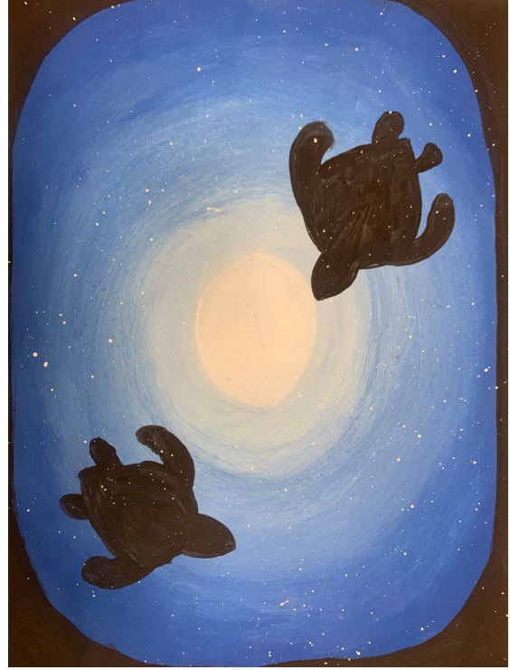
- Emma Nagle